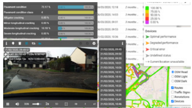
Figure 2 (below, right) shows the video of the road, with any defects shown at the correct location. If the trials are held to be successful, the system may provide much more integrated, detailed and up-to-date information for our engineers to respond more effectively.