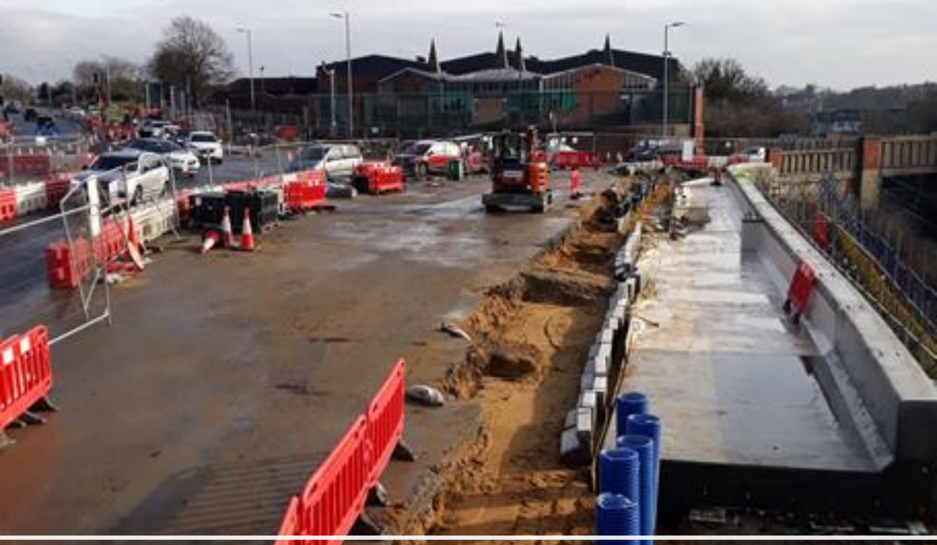
Bridge Construction area