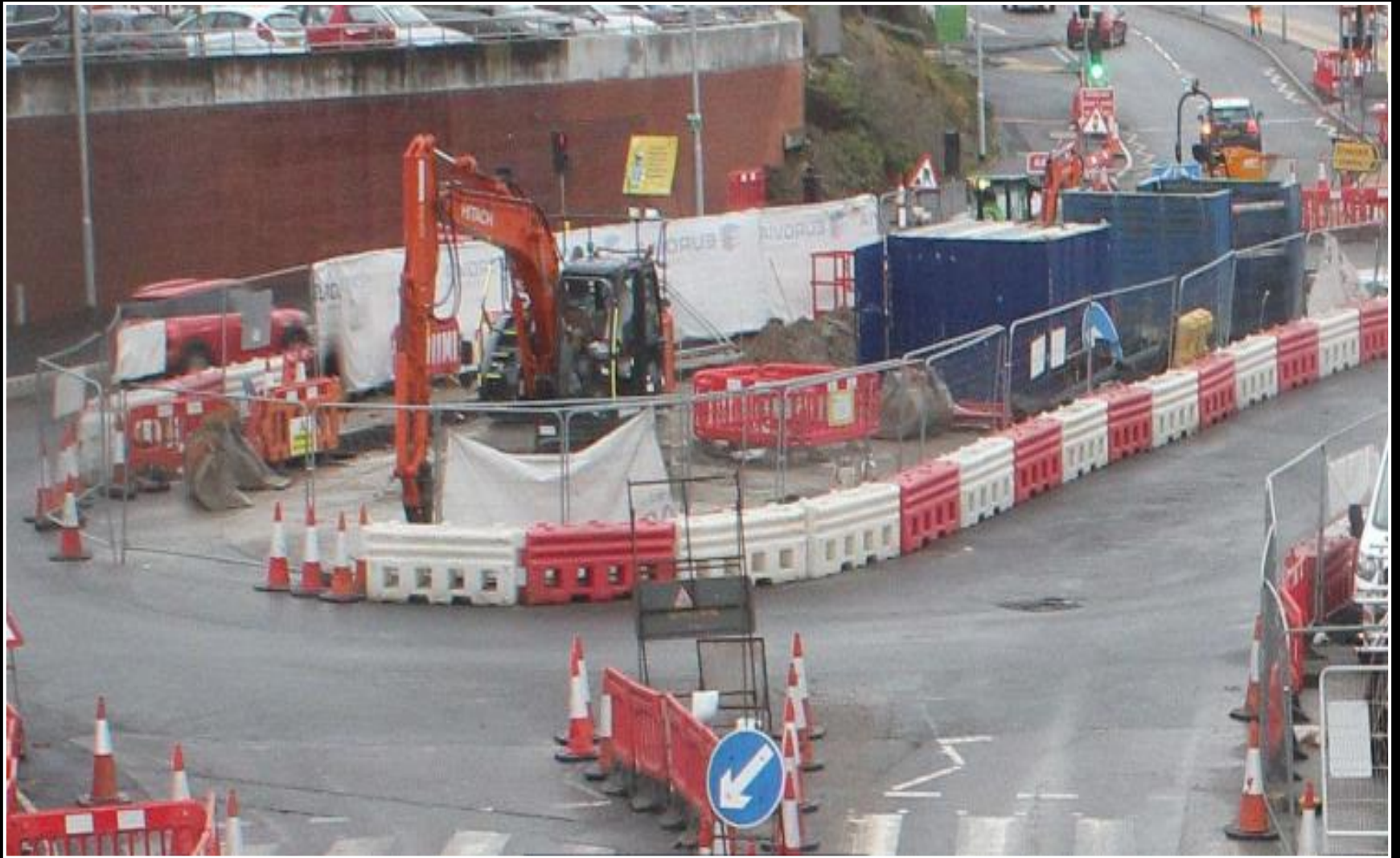
Ipswich Road A133 Roundabout construction.